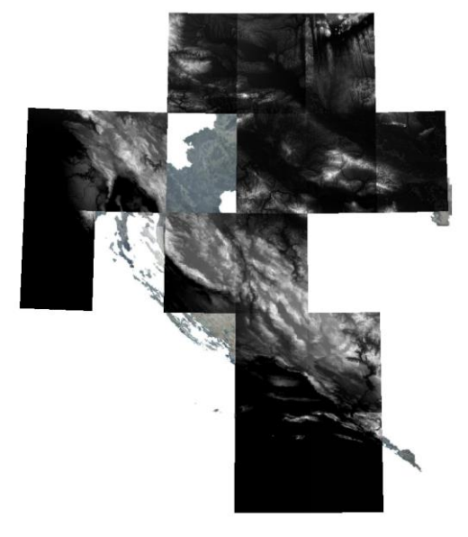
Figure 3: Overlay of DSM with DOF5