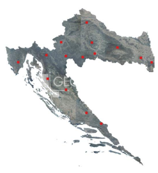
Figure 2: Pilot areas locations

For the pilot areas, 12 locations on the territory of the Republic of Croatia were selected on the official base maps of the State Geodetic Administration (DOF5) (Figure 3). Location that are completely or predominantly covered vegetation were selected and they were distributed across different regions of the Republic of Croatia in order to obtain the most relevant results of the pilot project, taking into account the diversity of relief and cover. The areas are defined by squares 2500x2500 meters (Figure 2).